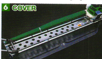
Plate material change aluminum from plastic. It can cover whole width between frame s. It's improved for user safety.