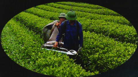
One Man Tea Harvesting Machine AM-120V